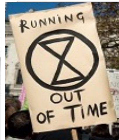
Call to adventure.