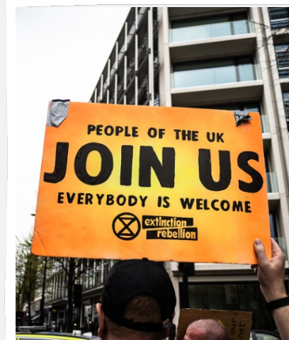
Crossing the threshold.