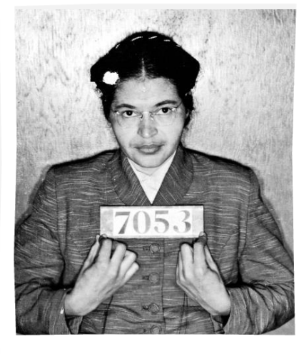
Crossing the threshold.