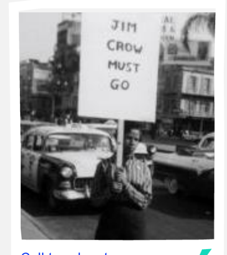
Call to adventure.