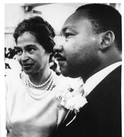
Mentor, allies and gifts.